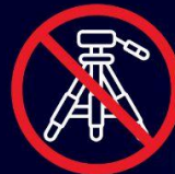
TRIPOD & MONOPOD