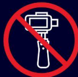
GIMBAL / STABILIZER