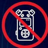
MICROPHONE & ADDITIONAL AUDIO